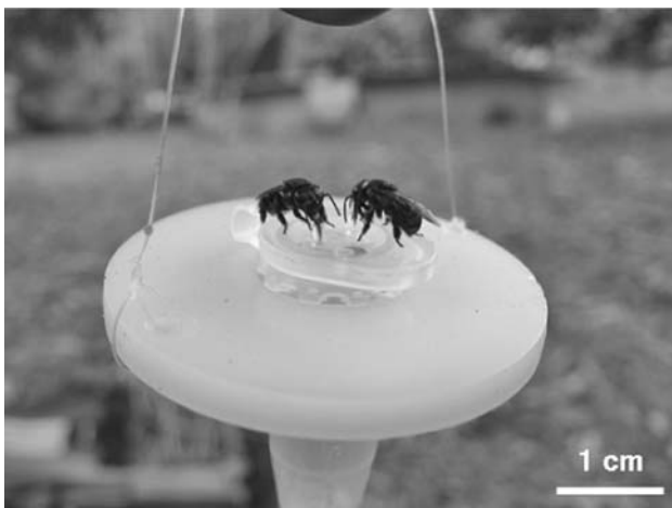
Fig. 1 Artificial “flower” used in this experiment, with two feeding S. aff. depilis foragers

Feeders consisted of yellow 1.5 mL Eppendorf tubes from which four capillary tubes protruded by 1–2 mm (Figs. 1, S2). Each tube rested in a white nylon washer upon which bees stood when feeding and interacting.