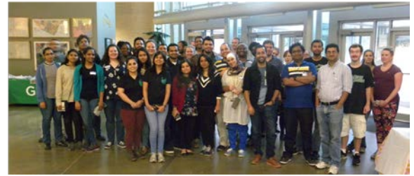
Graduate students at the BGSA annual mixer

The Biology Graduate Student Association hosted its annual mixer on October 5, 2016. The goal of this event was to promote communication between graduate students, post docs and faculty, and provide an outlet for them to know each other, discuss their work, exchange ideas and become aware of future opportunities in academia and industries. It also provides an opportunity for new students to meet their colleagues and find out from their peers about graduate life and resources at UNT.